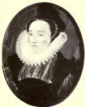
MARY, QUEEN OF SCOTS BY NICHOLAS HILLIARD